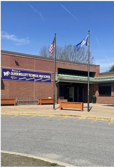
Oliver Wolcott Technical School Erected 1957